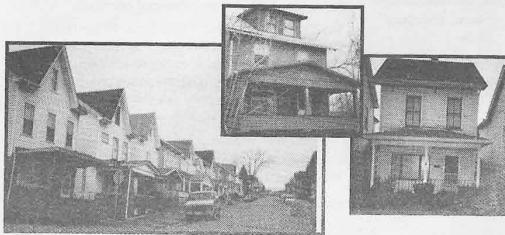
A Magazine of Art, People & Community